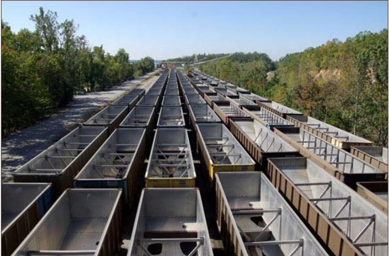
This shot was taken on October 12, at Grand Rivers, KY. The long-vacant BRT3 trackage is now being used to store excess coal hoppers. The coal business is off a bit both due to economics and to the mild summer weather.