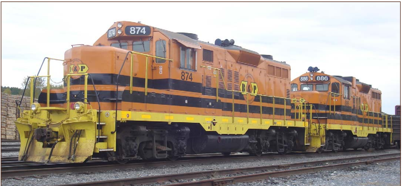
The Coming Storm: On the eve of Pennsylvania's first snow of 2009, two Buffalo & Pittsburgh GP9s idle at the DuBois, PA yard on 14-Oct-2009 awaiting their next duty on the Dubois locals.